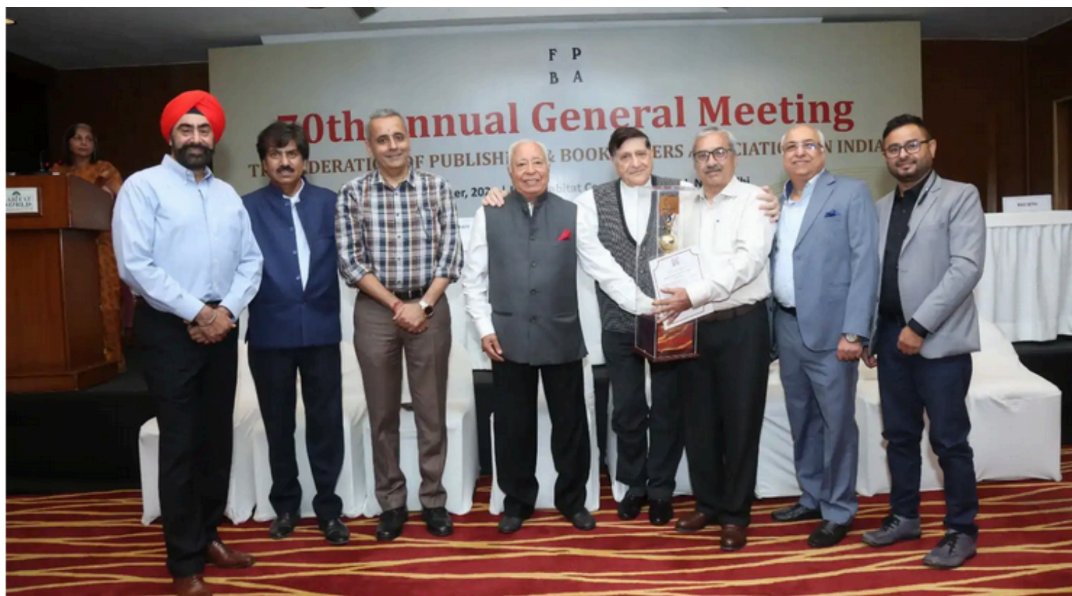
Receiving the Golden Award on Completing 50 Years in Publishing Industry on September 28th, 2024